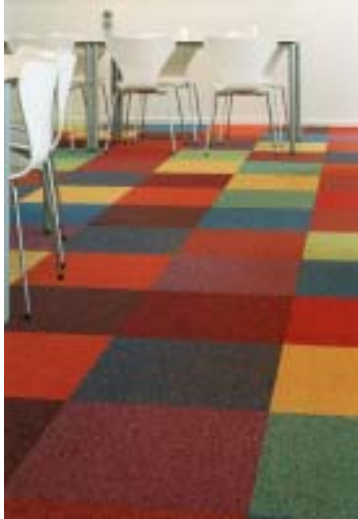
Carpet tile on Colback SMR primary backing