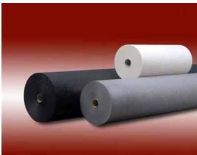
Colback: Wide range of nonwoven primary backings