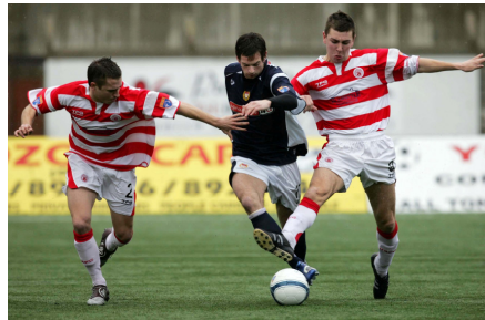
Artificial turf pitch Hamilton, UK